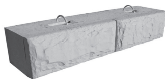
Dual Face Block

The Dual Face Block provides for above grade applications.