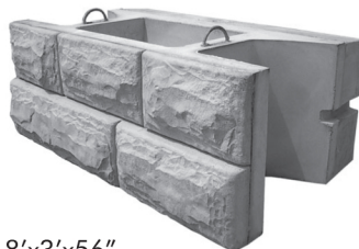
24SF Mass Extender Block

The addition of the extender to the 24SF block provides for greater gravity wall heights.